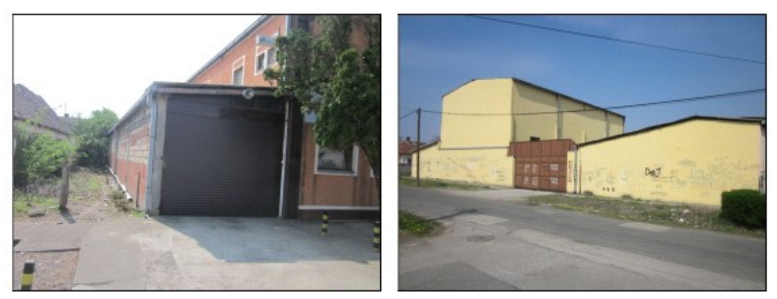
Figures 9 and 10: Warehouse with garage - street view and view of back facade