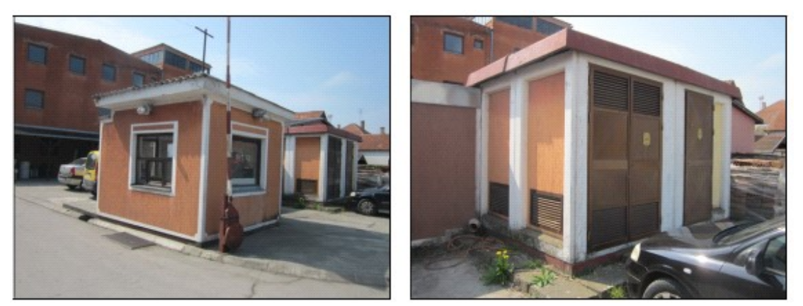
Figures 11 and 12: Guardhouse and substation - yard and street view

The entire complex has a complete infrastructure. The facilities are equipped with electrical threephase electricity, plumbing and sewerage, central heating, telephone installation, lightning and fire protection, gas installations, compressed air installations, in accordance with the purpose of each facility.