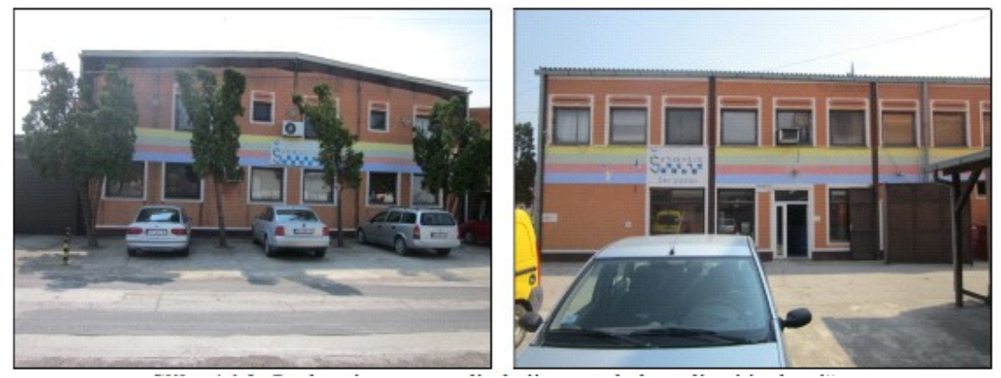
Figures 1 and 2: Office space - Directorate - Street and yard views