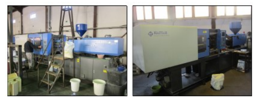
Figures 15 and 16: HAITIAN SA 3800/2950 and SA 1600/770