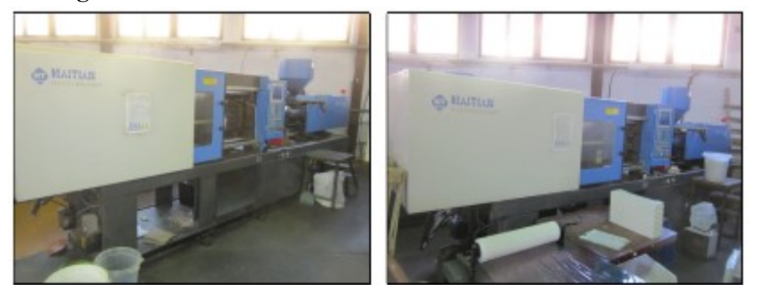
Figures 17 and 18: HAITIAN SA 1600/770 and SA 1200/600