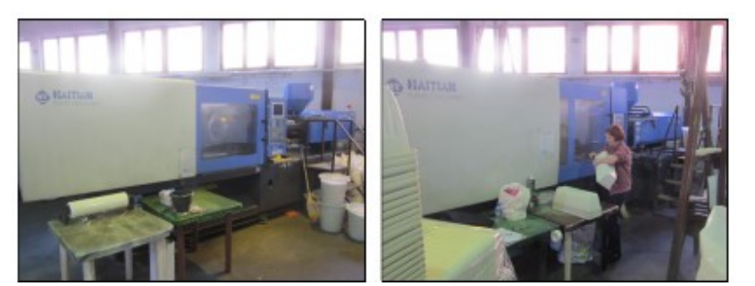
Figures 23 and 24: HAITIAN SA 2500/1000 and SA 3200/225