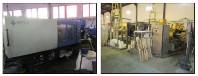
Figures 25 and 26: HAITIAN SA 3200/2250 and SA 3200/2250 and TERMOPLAST 10000kN