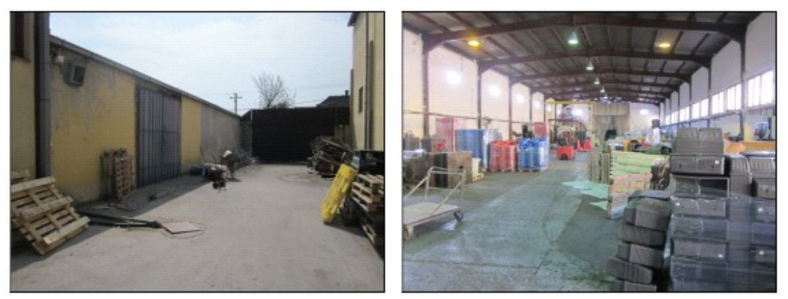
Figures 3 and 4: Production hall with workshop - yard view and interior